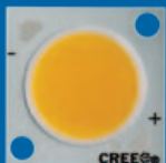
XLamp CXA2011 LEDs